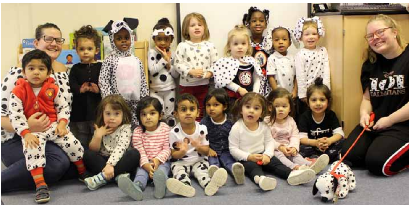
Kinder Class: 101 Dalmations