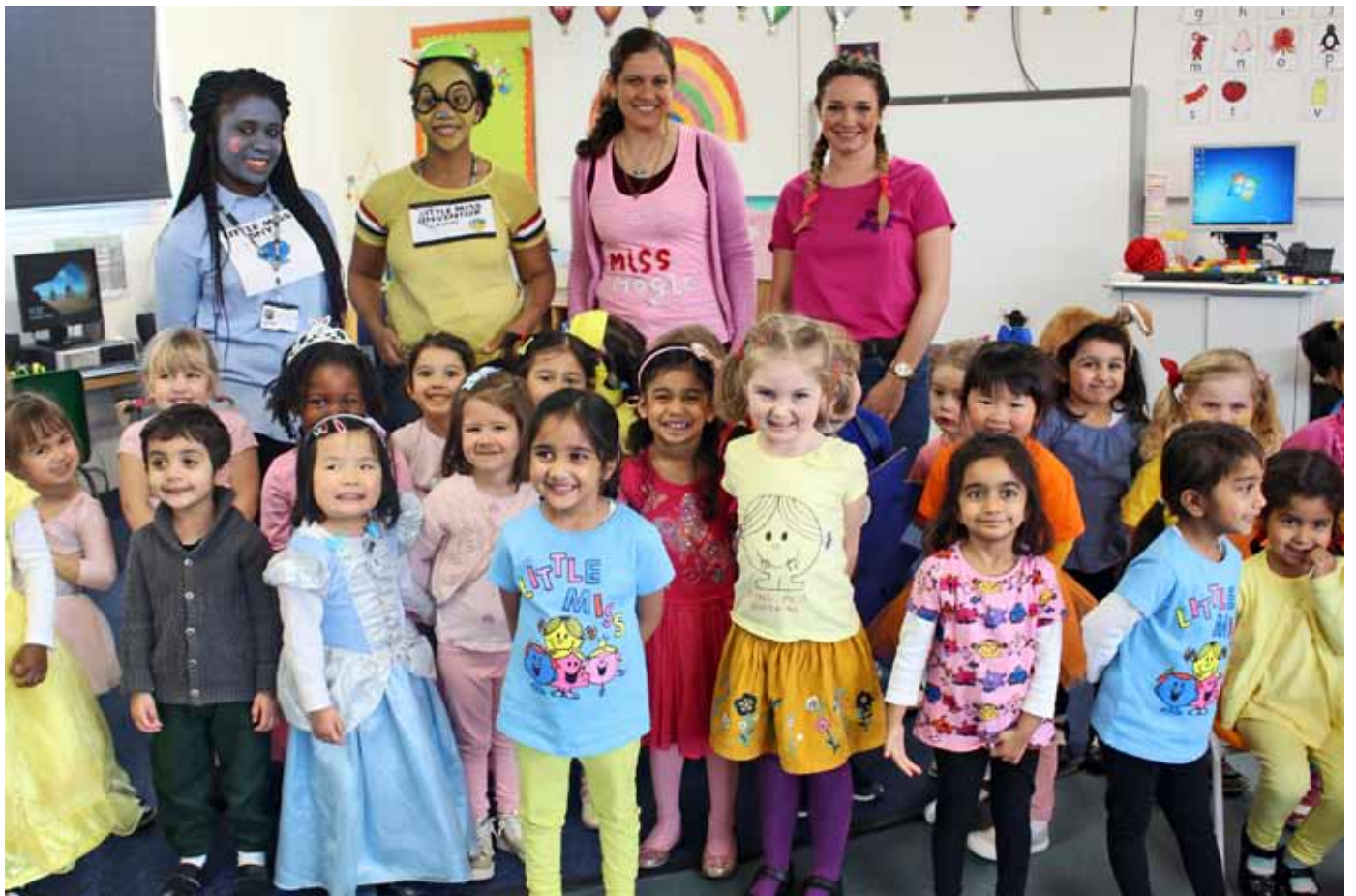
Pre School Class: Mr Men and Little Miss