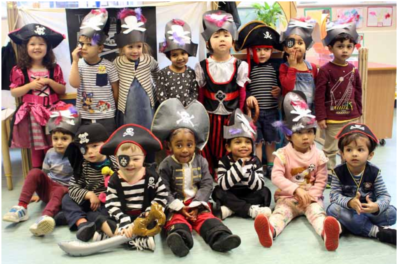
Transition Class: The Pirates next door