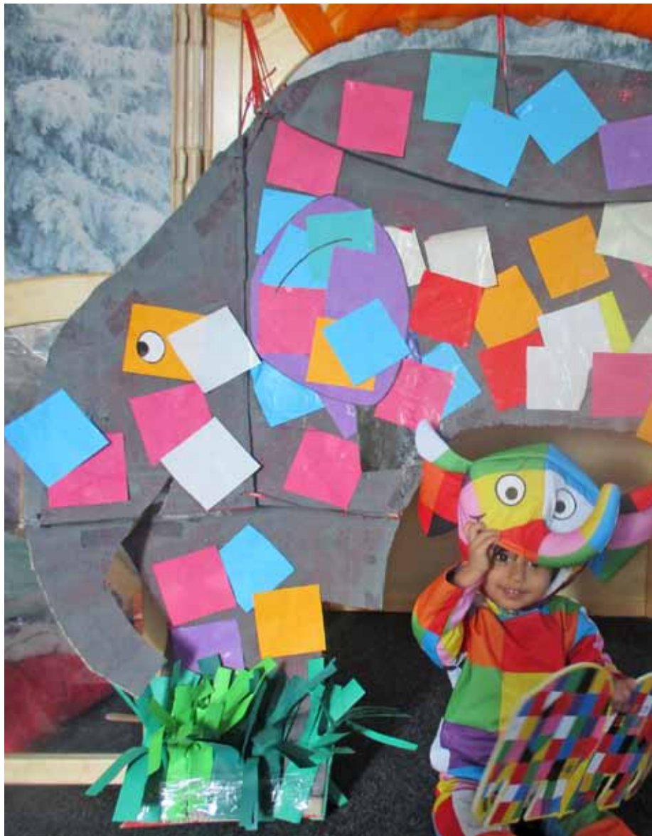
Toddler Class: Elmer the Patchwork Elephant