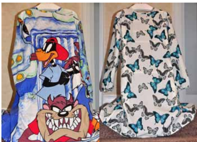
PPE isolation gowns

Thanks to the kindness of neighbours who left a daily delivery of material on the doorstep, my sewing machine hummed as I made PPE isolation gowns and laundry bags, using repurposed duvet covers and sheets.