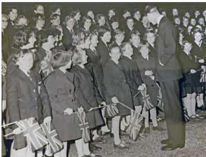
The Duke stops to chat with the girls.