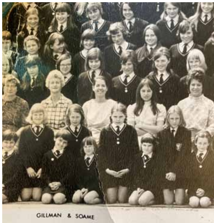
Right hand side of school photograph, 1971, showing name of photographer, Gillman and Soame

I enjoyed looking at the photos after all these years and I was struck by how young many of the teachers look. 1971 was the year I took my A levels. The photo represents a time when I