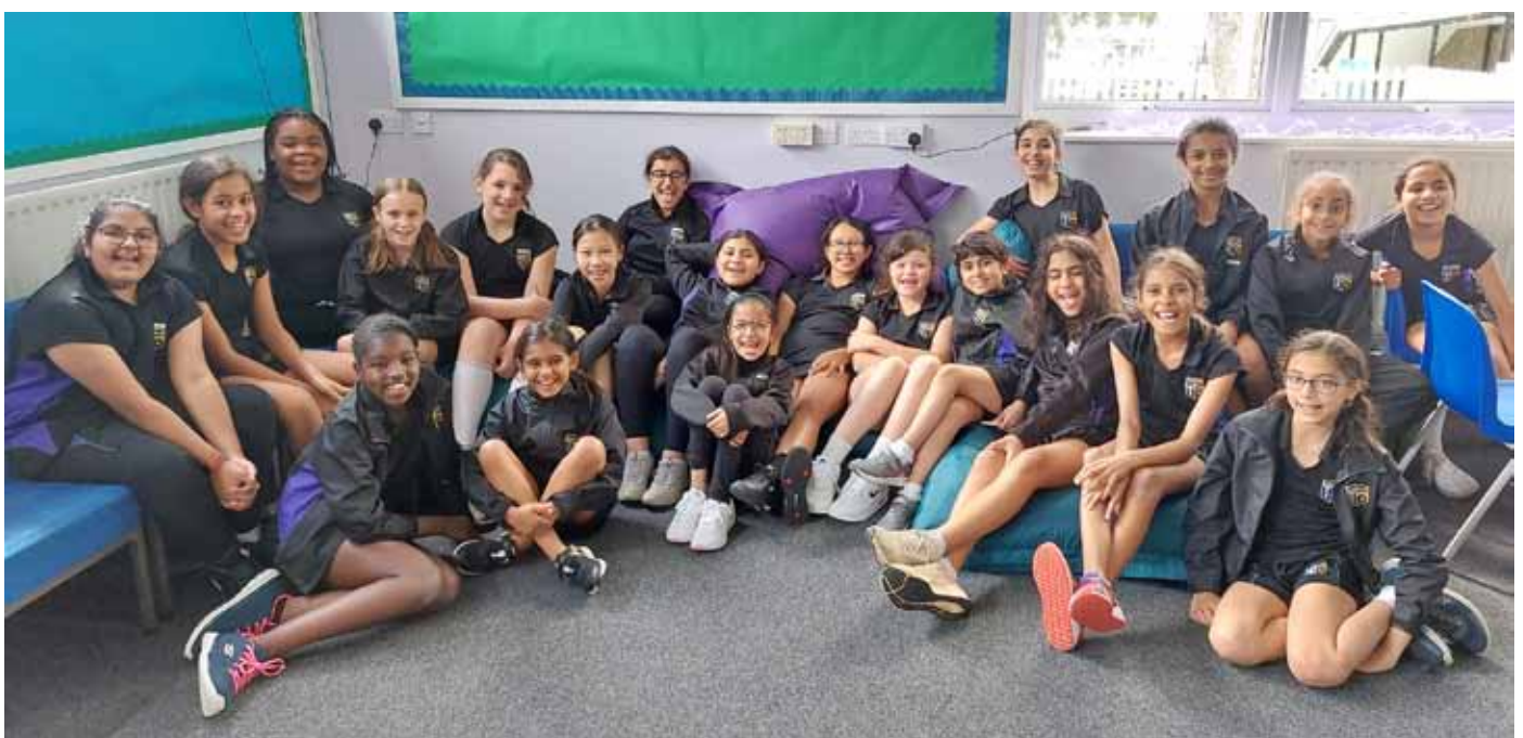
Year 6 had just one word to describe how they felt about their new Year 6 common room, and that was 'amazing!'