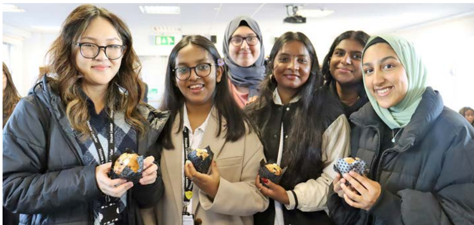
The OPA treated students and staff to muffins