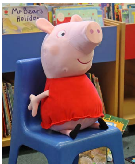
Miss Tosh invited a very special guest